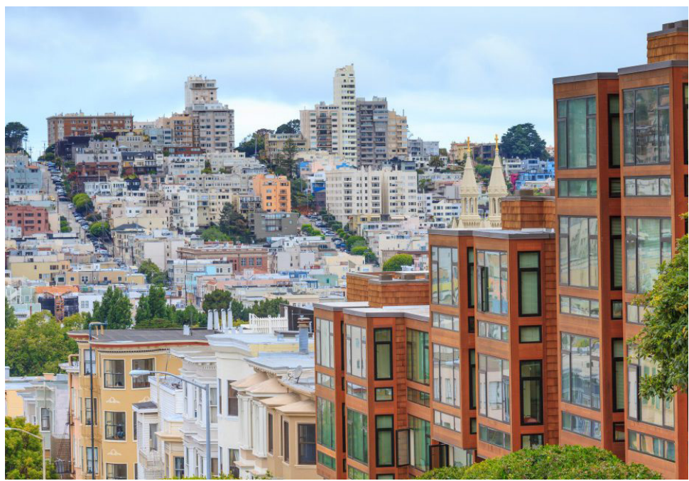
San Francisco, CA