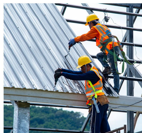
the Associated General Contractors of America and the American Institute of Architects.

Using software like ConstructConnect Project Intelligence can help you discover construction job leads in the markets where you want to work and connect you with qualified contacts.